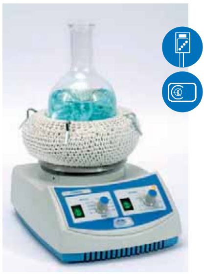
Stirring mantle, complete.